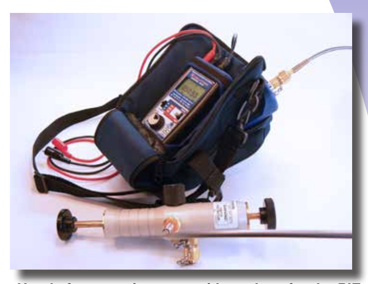
Hands free carrying case with pockets for the PIE 830 and the Pressure Module. Back of case has zipped pocket for the manual, test leads, hoses & pressure fittings.