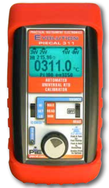
Thermocouple and RTD