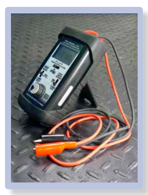
More Than a Simple Boot Flip out the tilt stand and free up both hands for calibration adjustments

PIÈ Calibrators are made in the USA and are backed by a Three Year Warranty. All PIE Calibrators come with a free NIST Traceable Certificate that is signed and dated. Altek's come only with an unsigned Statement of Calibration Practices with a certificate of calibration available for an extra charge. We recommend annual recalibration of our products. Contact PIE or your local distributor for factory recalibration. Calibration may also be performed by your company's calibration laboratory or any of your qualified calibration vendors. Calibration procedures are posted on our website.