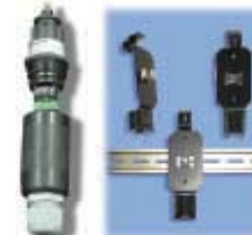
Remote Mtg. Kit

Use MSG 51-52-16-71 to order by catalog number. Select from Table II: