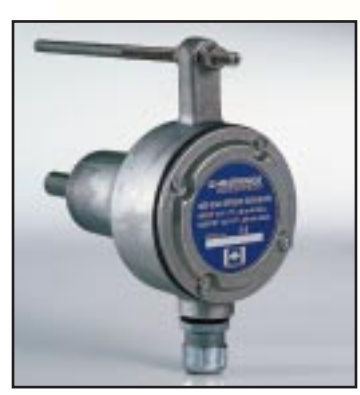
MD-256 Speed Sensor