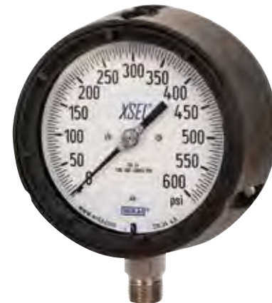
Bourdon Tube Pressure Gauge Model 232.34

Medium: max. +212°F (+100°C) (See Note 1 on reverse)