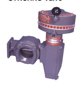
2-1/2" -M SYNCHRO Valve with standard cam assembly