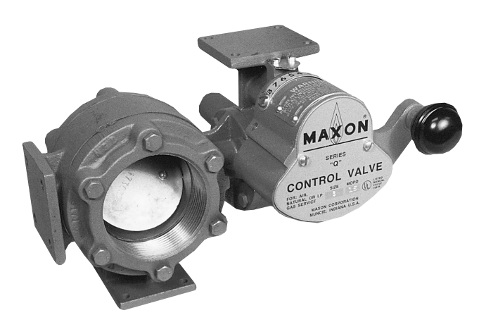
3" Series "Q" Valve

Series "CV" Control Valves incorporate a fullflow, fixed gradient butterfly valve design for high capacities at low pressure drops, using minimum operating torque.