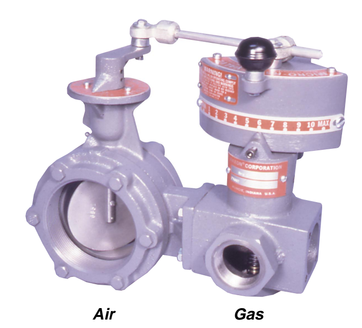
M- 4" x 1-1/2" -P MICRO-RATIO® Valve

MICRO-RATIO® Valves covered by U.S. Patents 2,286,173; 2,035,904; and 3,706,438.