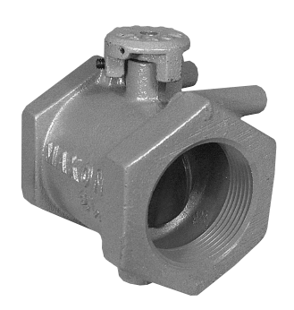
2-1/2" Series "BV" Valve