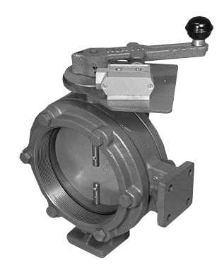
M-6" Manual Air Control Valve with optional Low Fire Start Switch