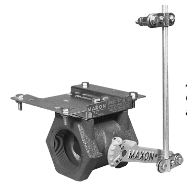
2" Series "CV" Valve with optional connecting base and linkage assembly

Series "Q" Valves are UL (Underwriters Laboratories) listed for use with air, natural gas and liquefied petroleum gases.